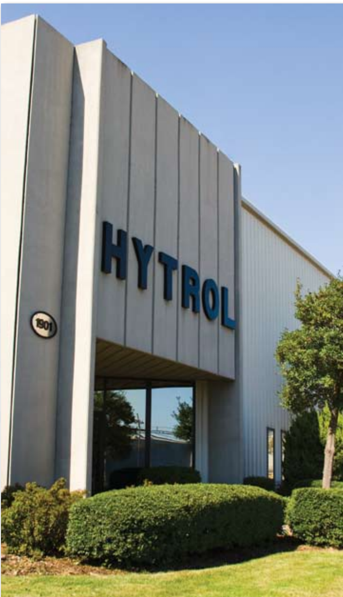
Hytrol Technology Center