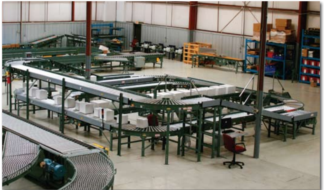
E24™ Test System

Design collaboration is another reason for visiting the Tech Center. Hytrol's engineers and Integration Partners meet with customers to discuss the requirements for new types of equipment to meet their needs. Dialogues can result in prototypes and design reviews, which can ultimately lead to the enhancement of existing products or new products.