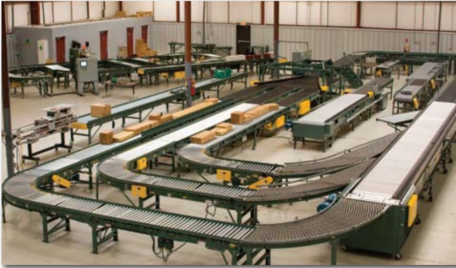
High-Speed Sortation Test System