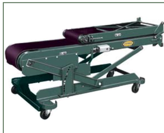
HINGED BED FOLDS FOR EASY STORAGE