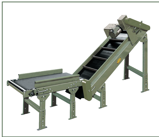
FEEDER SHOWN WITH STANDARD PC TYPE GUARD RAIL, GRAVITY BRACKET WITH POP-OUT ROLLER AND OPTIONAL MS TYPE FLOOR SUPPORTS

CAPACITY —300 lbs. total distributed load at 65 FPM.