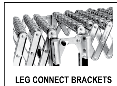
LEG CONNECT BRACKETS

LEG CONNECT BRACKETS —Connecting two or more conveyors.