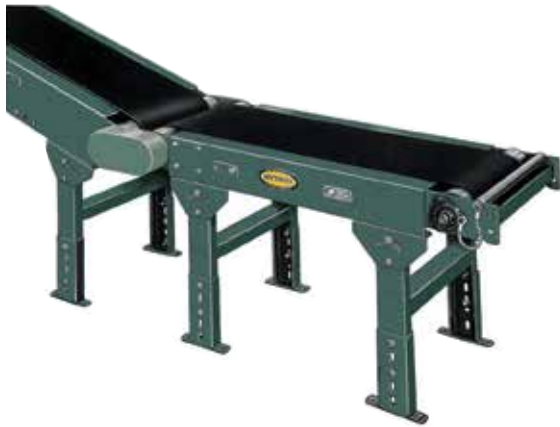
SHOWN WITH OPTIONAL LOWER POWERED FEEDER AND SUPPORTS

FLOOR SUPPORTS —Now supplied as optional equipment.